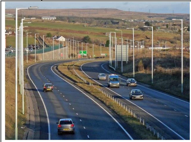
Box 4: Impact evaluation: Infrastructure in Wales

In Wales, the MA recently undertook a procurement exercise for their evaluation of infrastructure funded by ERDF in the 2000-06 and 2007-13 programmes. The aims of the evaluation are: