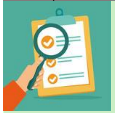
Box 2: Defining commitments of EU funding and co-financing in Finland

In Finland, commitments and funding (EU and national co-financing) is allocated to the regions via the Ministry of Employment and Economic Affairs (i.e. the MA) on an annual basis. The respective regional authorities (i.e. regional councils/the Centres for Economic Development, Transport and the Environment (ELY Centres)) in turn make decisions on the funding that will be awarded to projects. Therefore, 'selected operations' are decisions made on the EU funding of a project.